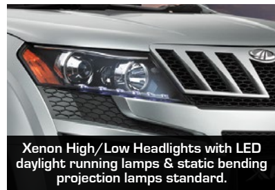
Xenon High/Low Headlights with LED daylight running lamps & static bending projection lamps standard.